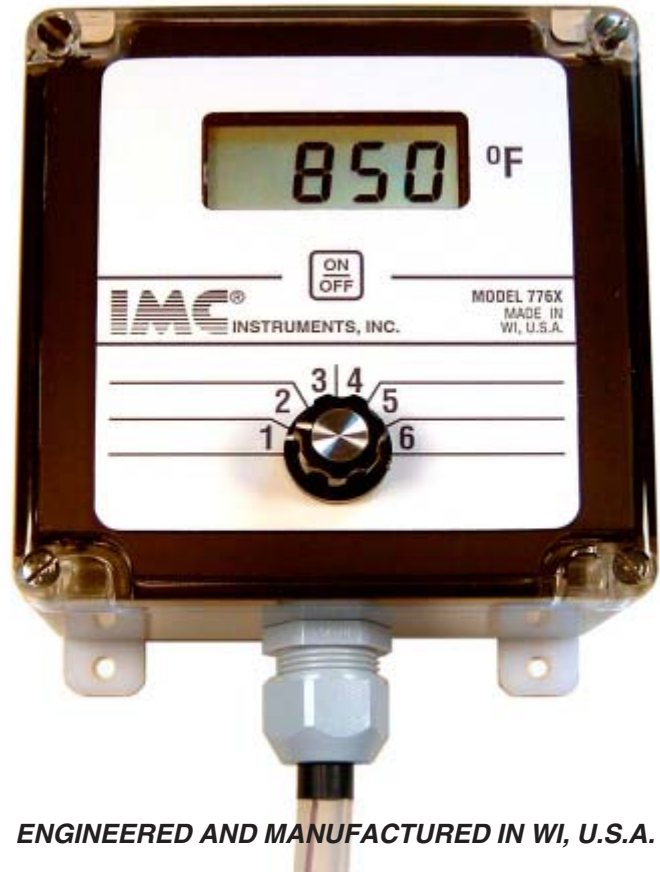
ENGINEERED AND MANUFACTURED IN WI, U.S.A.

Large selection of probes from hypodermic needle to ¼" dia. x 6 ft. long probes for permanent installation or hand-held use.