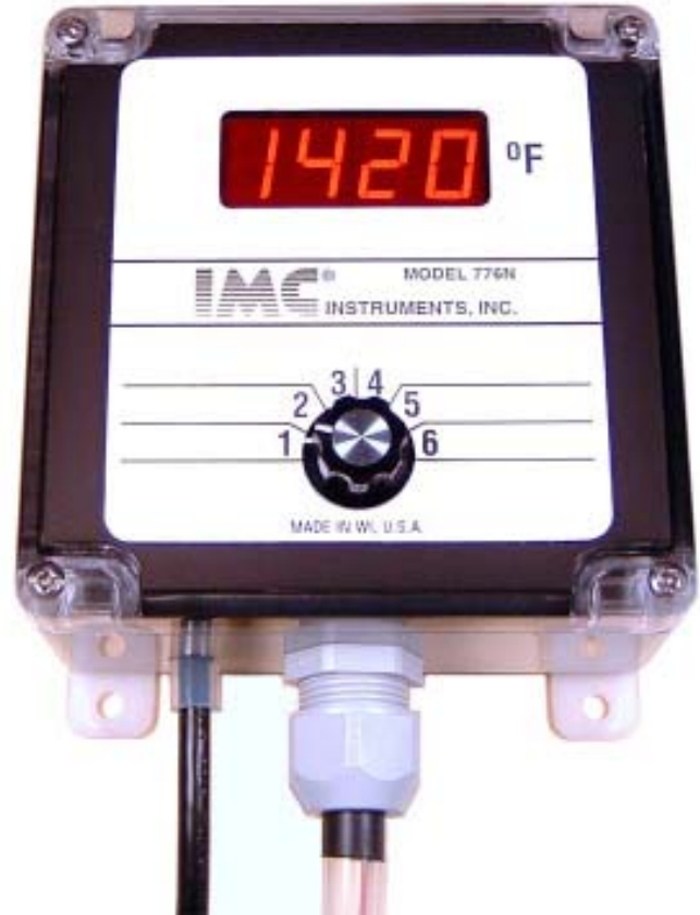
ENGINEERED AND MANUFACTURED IN WI, U.S.A.

Large selection of probes from hypodermic needle to ¼" dia. x 6 ft. long probes with or without handles.