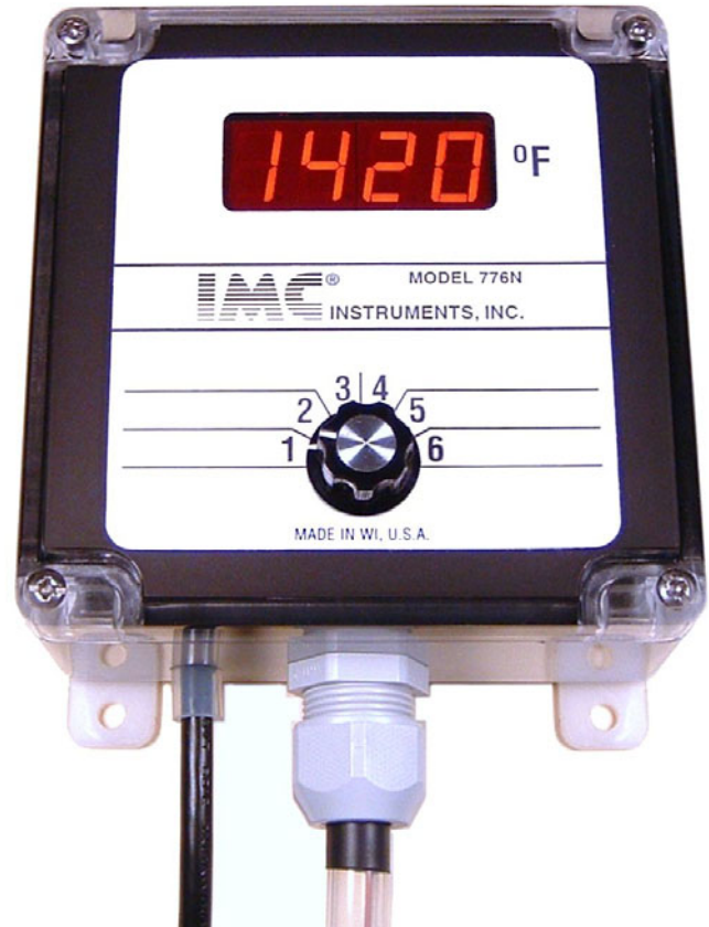
ENGINEERED AND MANUFACTURED IN WI, U.S.A.

Large selection of probes from hypodermic needle to ¼" dia. x 6 ft. long probes with or without handles.